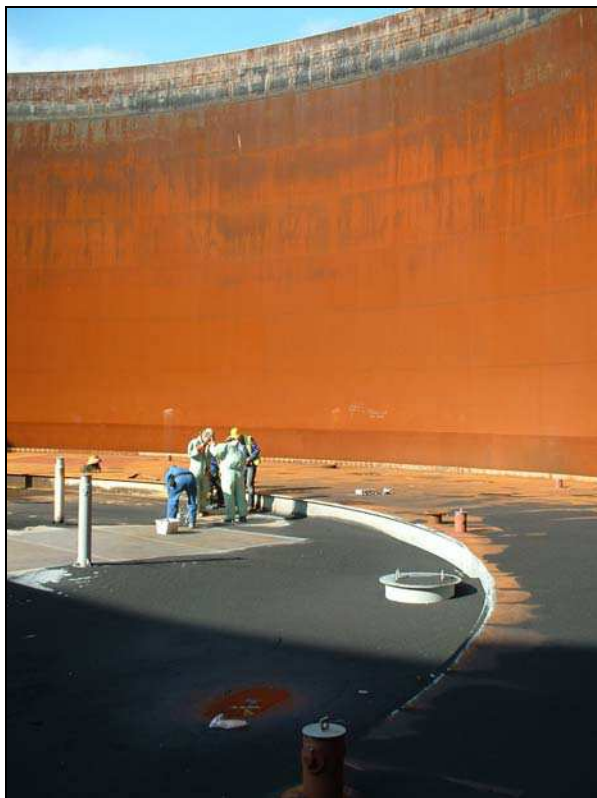
Close-up view showing true size