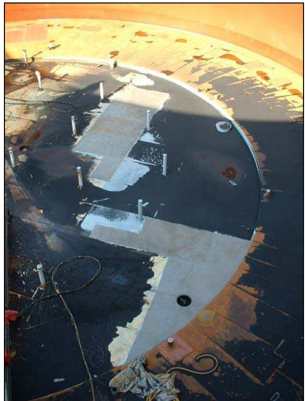
Aerial view showing blasted areas