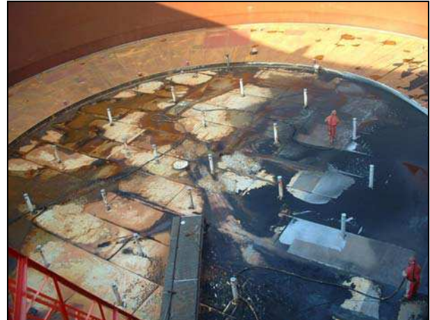
View of roof showing spent blast-media