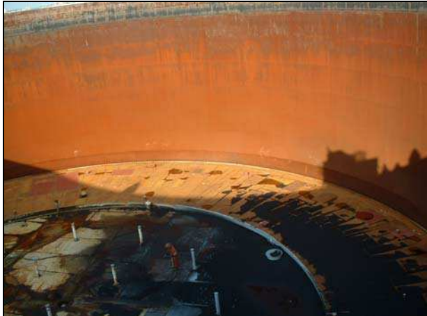
Roof-top showing corroded paintwork

Project: Floating crude-oil tank roof Location: Fawley, west of Southampton, England Completed: September 2007 Specification: Zinga 120-140µm