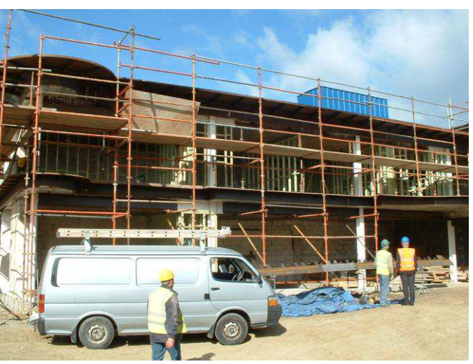
Above: A view showing the H-beams that were hidden by brickwork