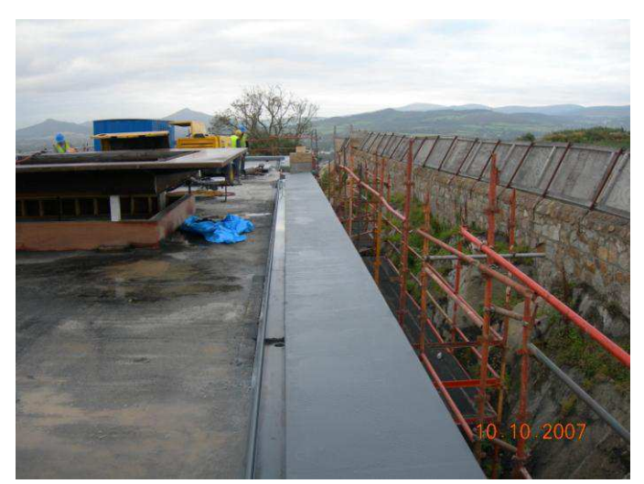
Above: One of the edging panels after zinganisation