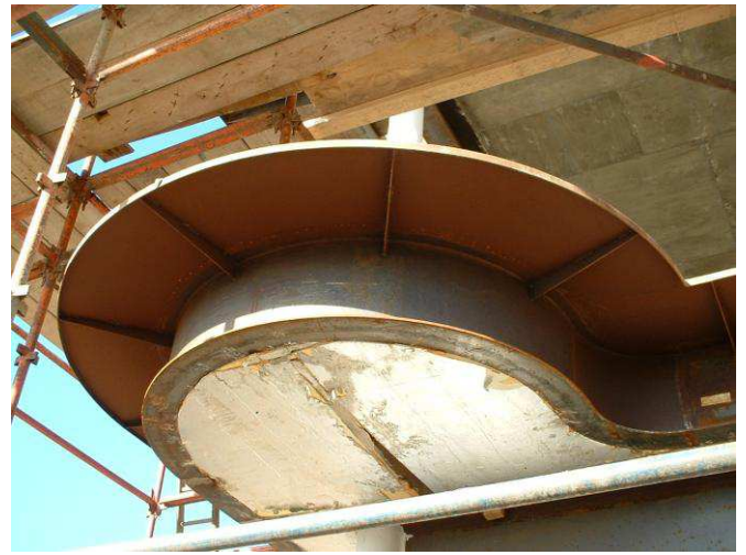
Above: The steelwork above the curved glass in the living room