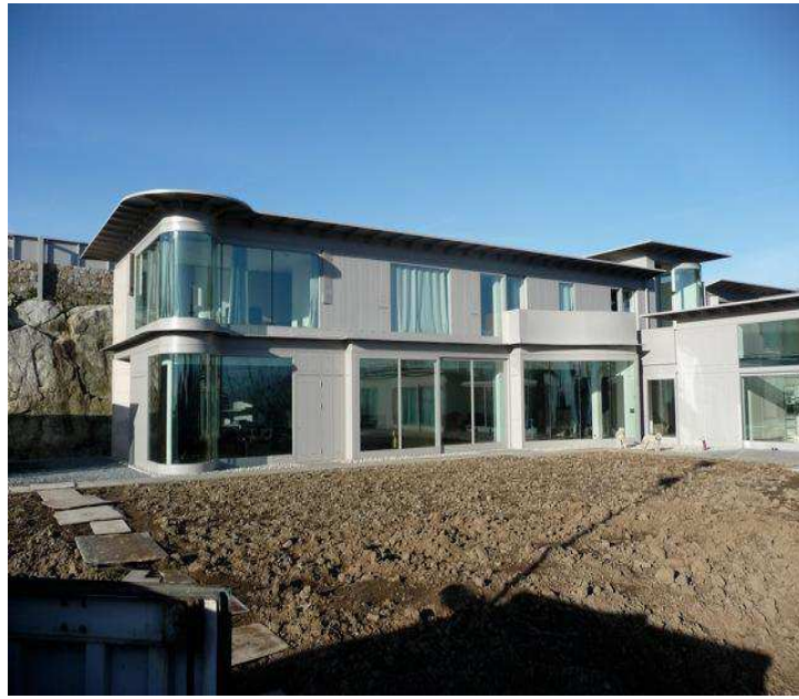
Front view of the house showing the steel canopy