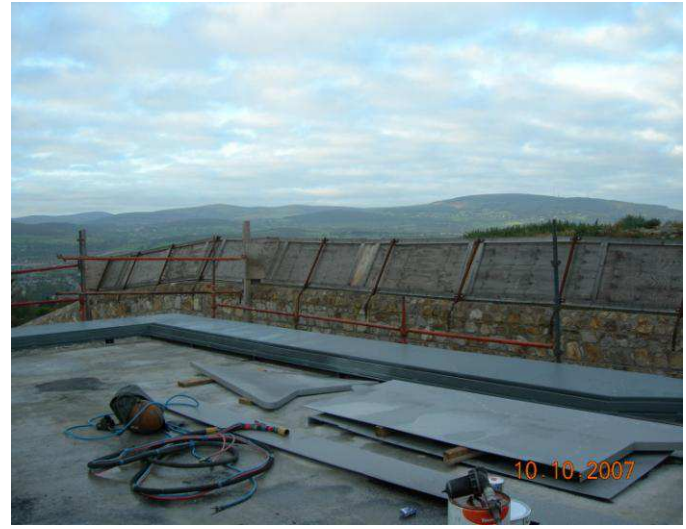
Above: Another section-view of the large roof area Above: The massive steel canopy over the front door of the house The roof is going to be ergonomic, with a grass lawn being planted across the entire area of the roof.