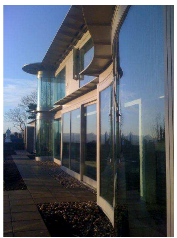
A side view showing the amount of steel used