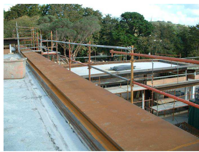
Above: The steelwork of the top edging-panels around the entire roof